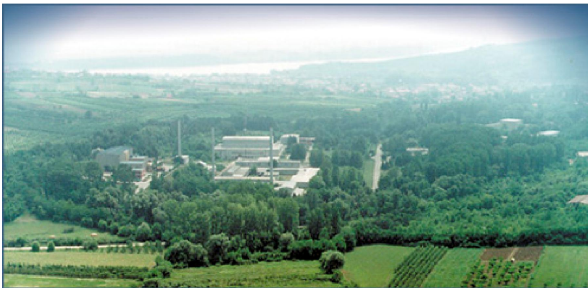
Conference Venue VINČA Institute of Nuclear Sciences